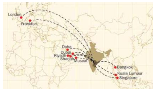
International Airlines flying out of Hyderabad

Hyderabad's Rajiv Gandhi International Airport (RGIA) is a world class International airport and is well connected nationally, regionally and internationally. Currently 11 major international airlines connect destinations in Europe and Asia, and partner airlines ensure connectivity with all parts of the world. New connections with international airports are envisaged and connectivity is likely to improve even more by 2014.